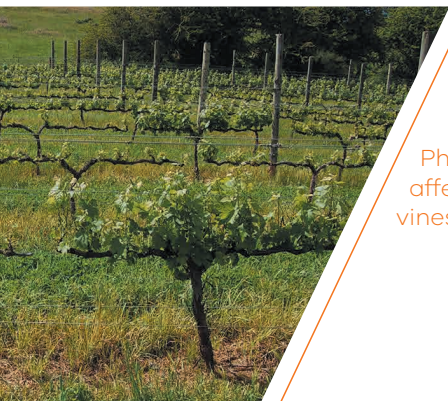
Phylloxera affected vines

If phylloxera is confirmed on your property, you will be notified and will receive advice regarding options for controlling the infestation.